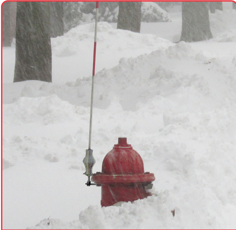
HYDRANT MARKERS HELP FIND HYDRANTS WHEN THEY ARE NEEDED MOST.