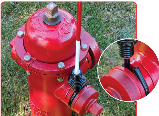
SIDE MOUNT MARKERS ATTACH TO THE HYDRANT HOSE NOZZLE.