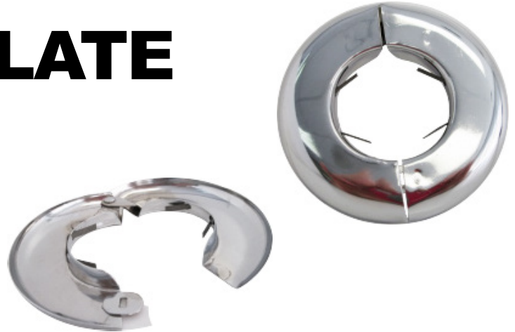
STEEL F&C PLATE