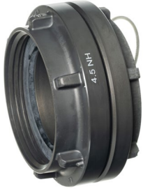
4½ NHT (NST) -5.76 OD X 4 TPI