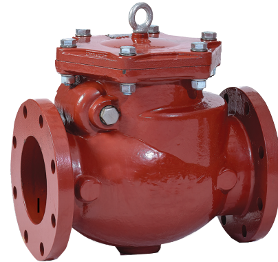
Sizes 5" to 12"